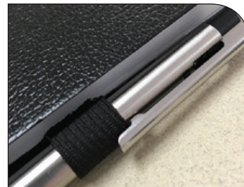
Optional pen loop See page 44

EARLY ORDER DISCOUNT: REDUCE UNIT PRICE BY 5% WHEN ORDERING DATED PRODUCTS BEFORE JUNE 1, 2017